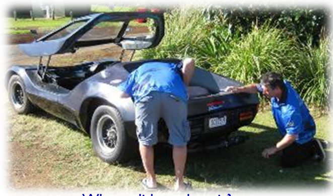
Where did you lose it?

Soon it was off to Byron Bay lighthouse via the lookout at Lennox Head for a short stop and then some.... small delay with Bruce's eureka leaving a trail of smoke found to be merely some fibreglass burning on the tail pipe. A small hacksaw was produced and the offending piece was removed. Have the picture to prove it.